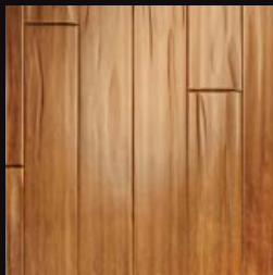
AHMCA33 Maple Canyon Maple