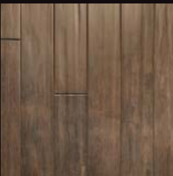
AHLIB32 Liberty Gray Maple