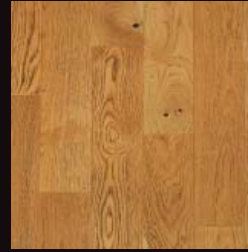
AHHOM34 Homestead Oak White Oak