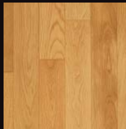
AHCOU2 Country Oak White Oak