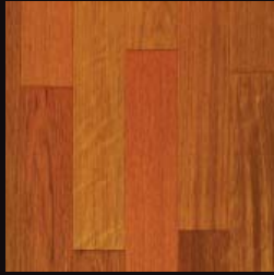
AHVIC31 Victorian Pride Brazilian Cherry