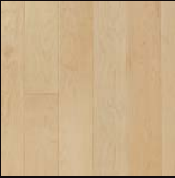
AHMLE5 Maple Legacy Maple