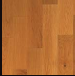
AHPRA20 Prairie Oak White Oak