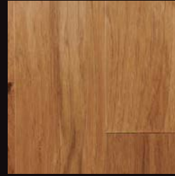
TB640 Dawn Assisi Hickory