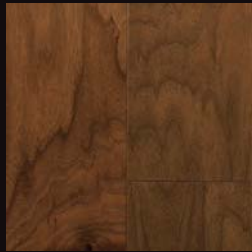
TB660 Roman Summer American Walnut