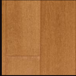
TB625 Verona Biscotti Maple