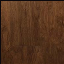
TB650 Sicilian Autumn American Walnut