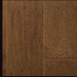
TB630 Terra Pompeii Maple