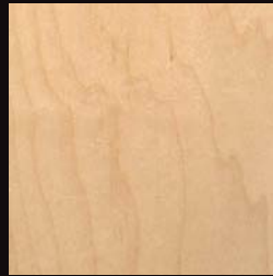
TB600 Sandrio Maple