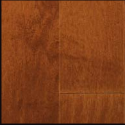
TB620 Naples Wheat Maple