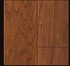
TB681 Bellagio Bronze American Cherry