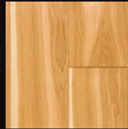
TB645 Veneto Hickory